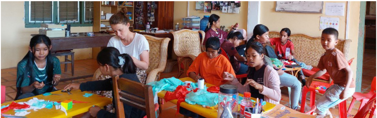
Sewing workshop: Making of pennant bunting

On the programme: traditional games and a festive evening! The teachers will also be there. The centre is preparing for this event, notably by making decorations: